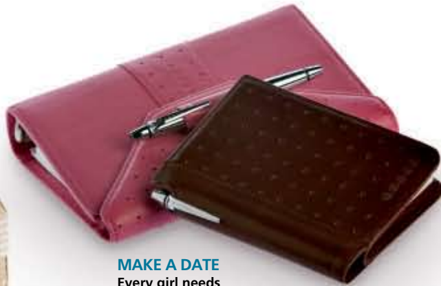
MAKE A DATE Every girl needs a diary so choose one in pretty pink or elegant black. R999, pink; R799, black, both Sandton Stationery & Print