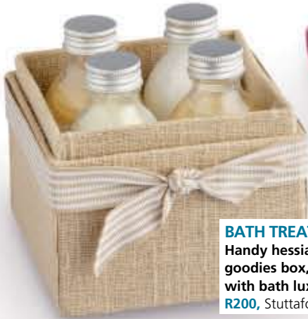
BATH TREATS Handy hessian goodies box, filled with bath luxuries. R200, Stuttafords