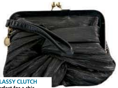
CLASSY CLUTCH Perfect for a chic Christmas dinner. R299, French Connection at Stuttafords