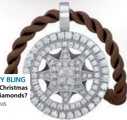
SWAROVSKY BLING What would Christmas be without diamonds? R4 035, Spilhaus

Spend a little or spend a lot, there's something to please every girl – grown up or otherwise – on your Christmas list